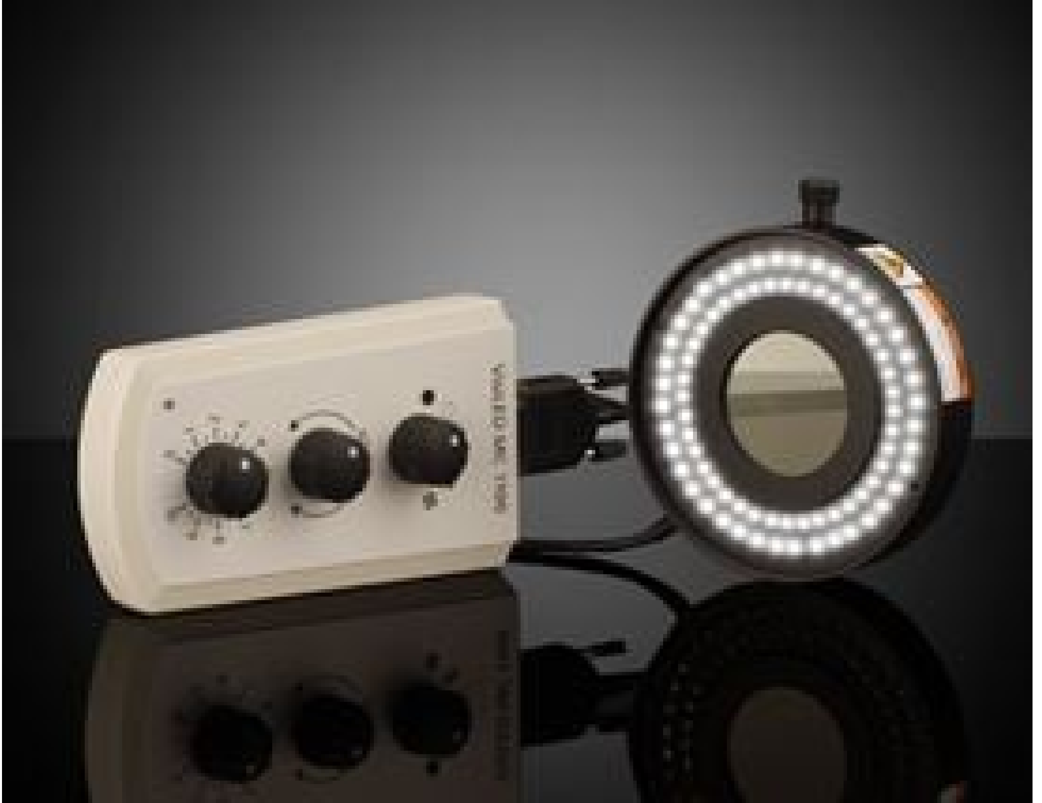
Ring light, controller & power supply required and sold separately.