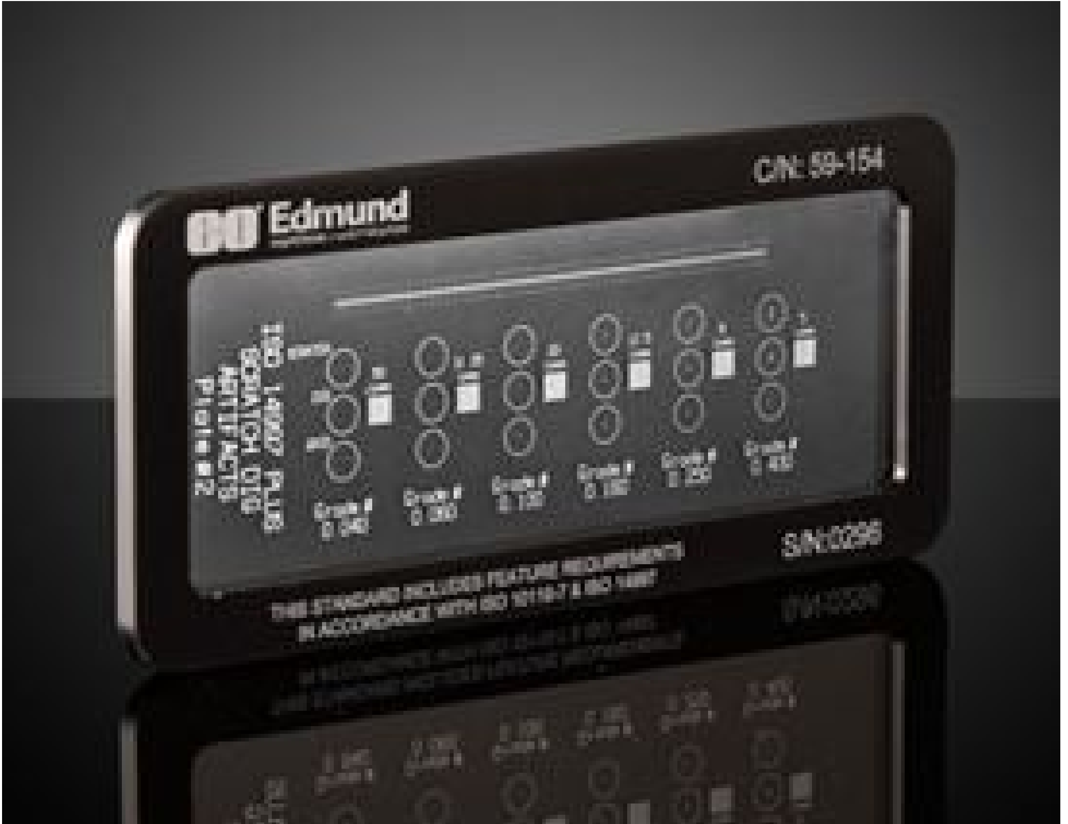
Scratch & Dig Target (1st Surface Positive), #59-154