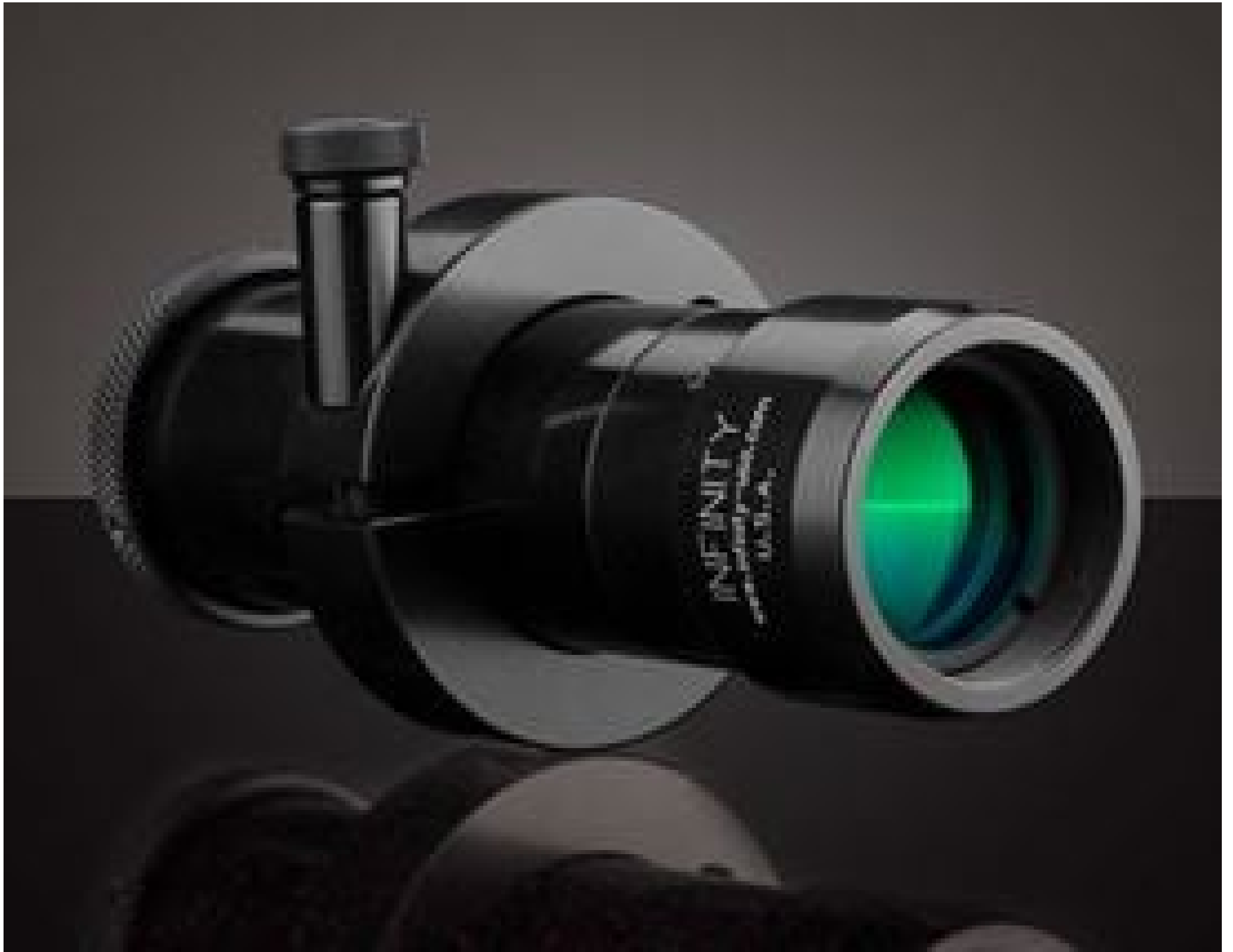
Standard (with no In-Line Attachment), InfiniTube, #56-125

See More by Infinity Photo-Optical Company