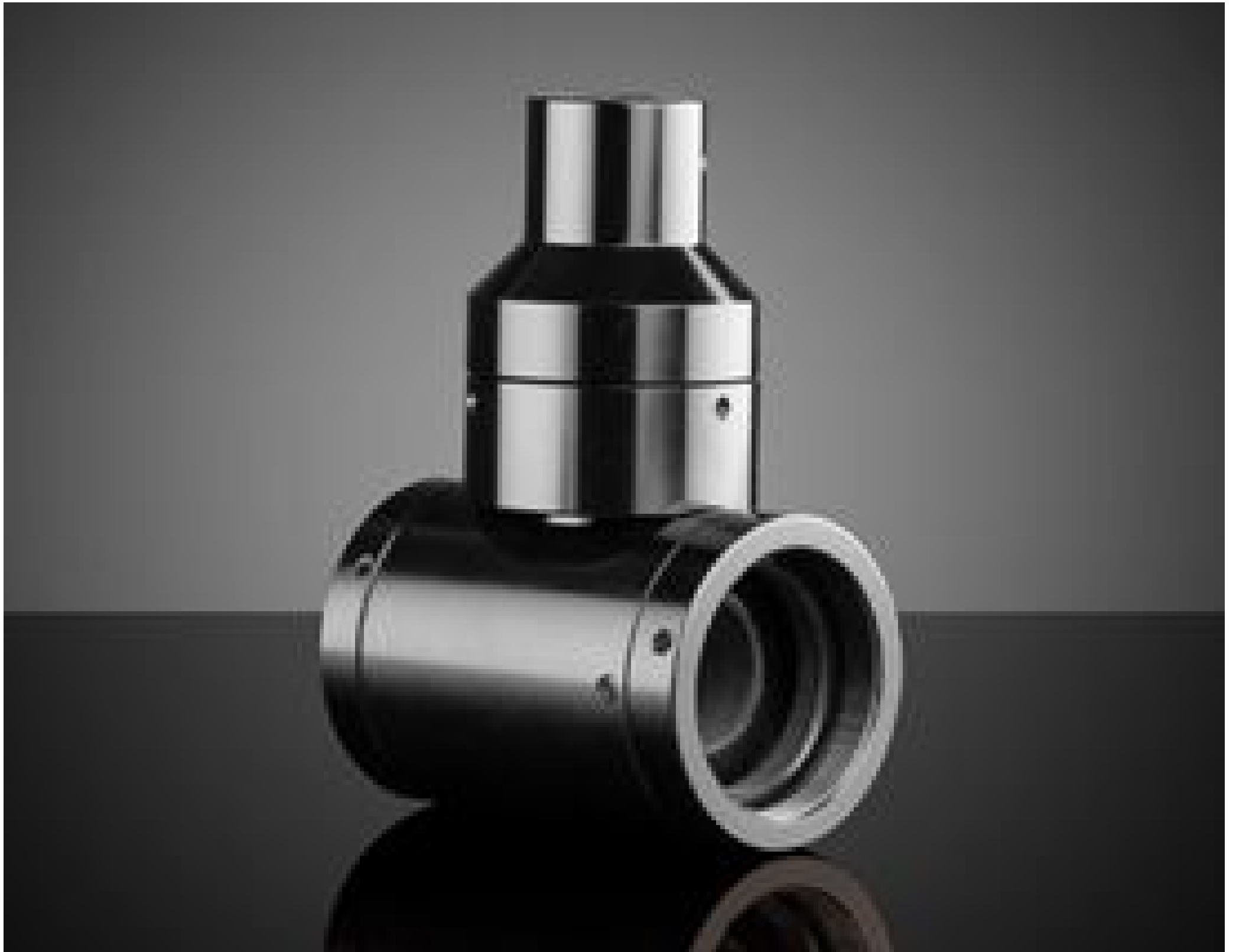
Standard In-Line Attachment (Optimized at 10X+), InfiniTube

See More by Infinity Photo-Optical Company