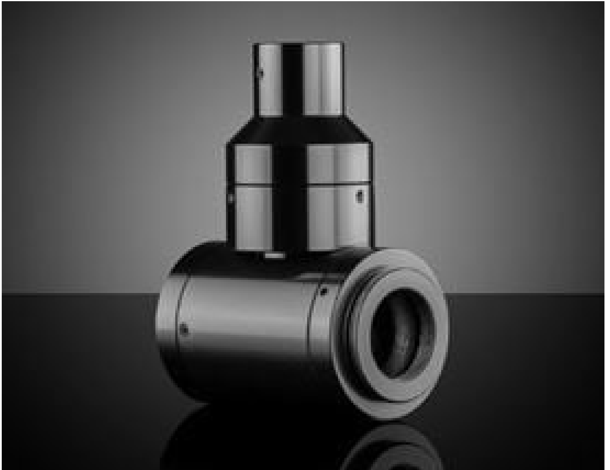
Standard In-Line Attachment (Optimized at 2X-10X), InfiniTube

See More by Infinity Photo-Optical Company