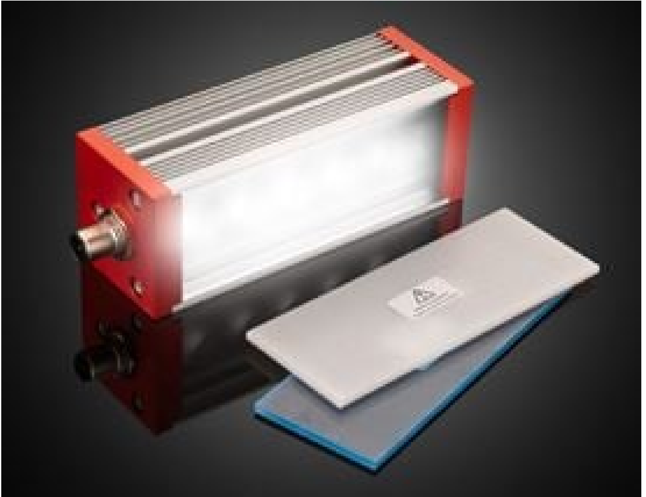
Effilux SWIR LED Bar Lights