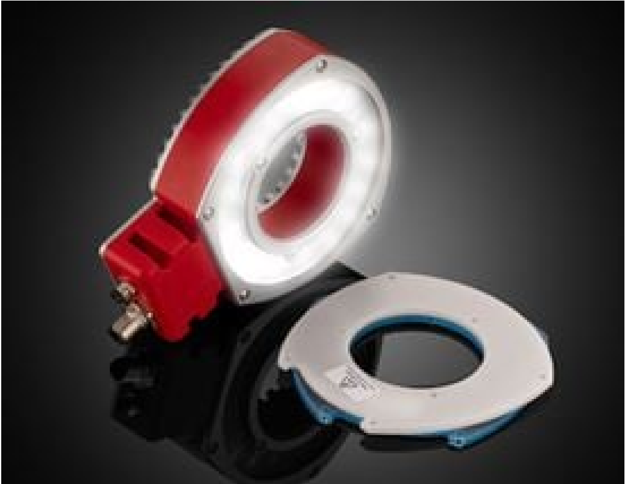
Effilux SWIR LED Ring Lights