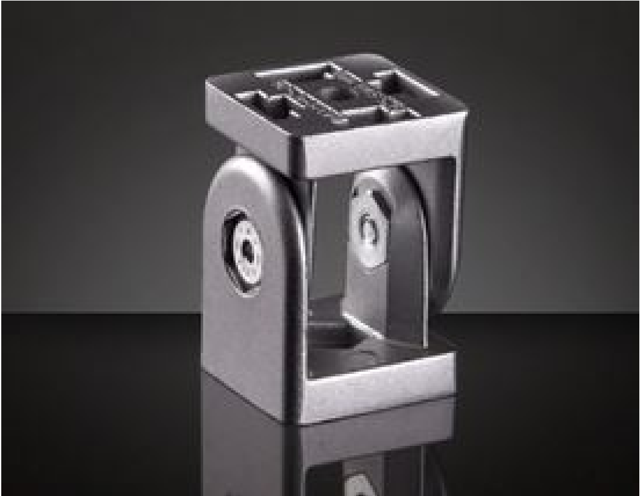
Swivel Mounting Accessory, #34-889