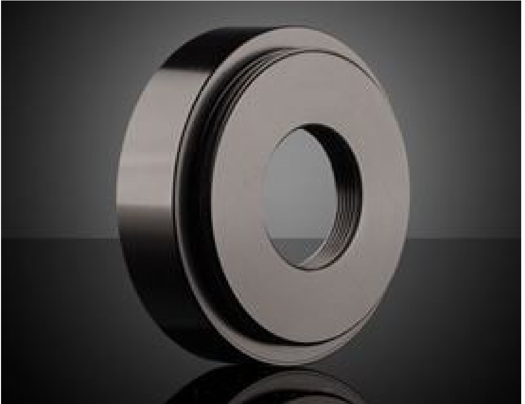
T-Mount Objective Ring Mount, #52-301