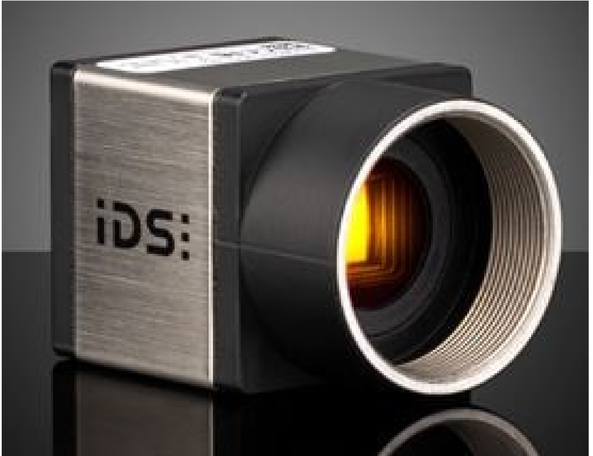
IDS Imaging uEye+ USB3 Camera, CP Model (Front)

See More by IDS Imaging Development Systems