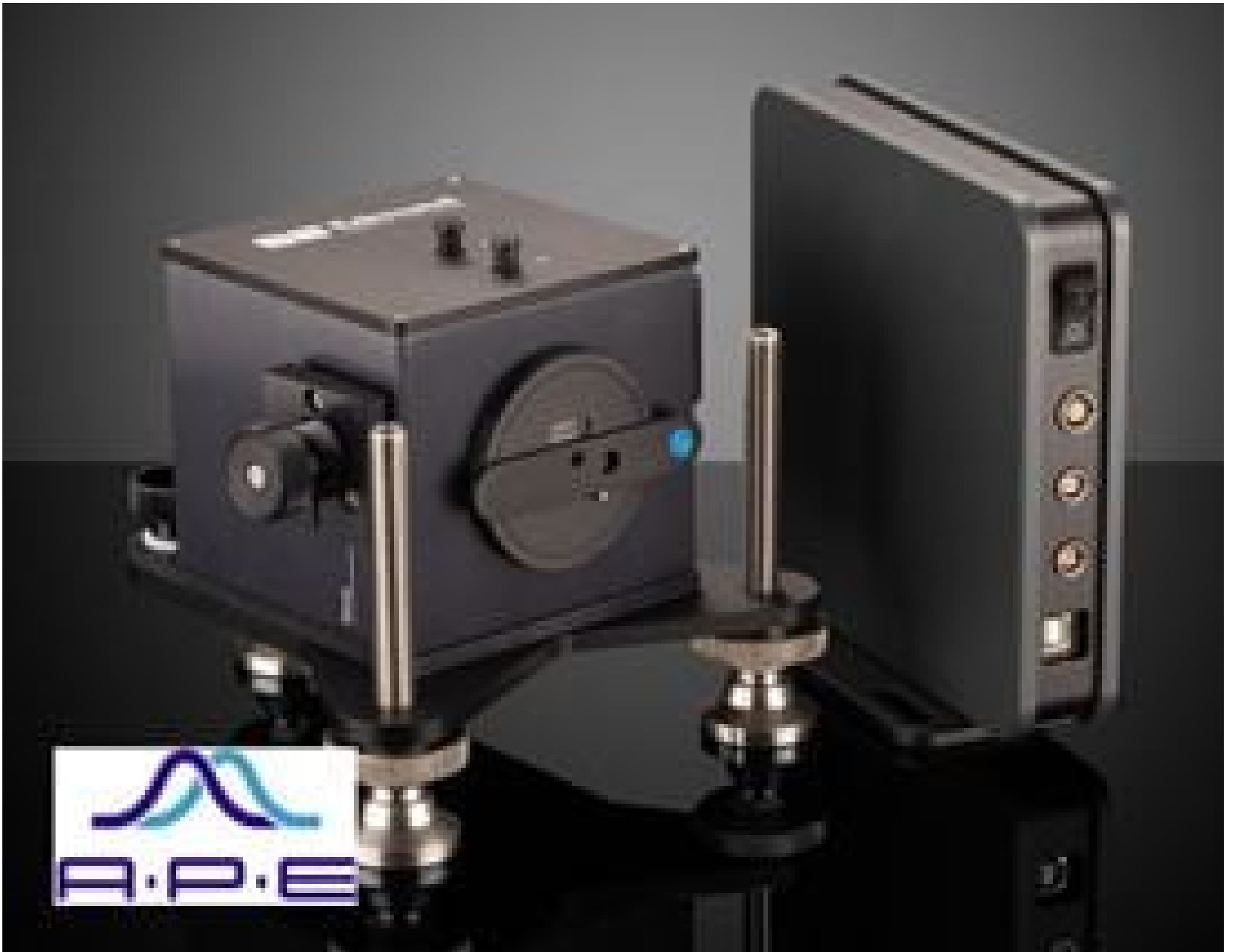
#11-760 Edmund Optics TPA Ultrafast Autocorrelator by APE (700-1100nm)