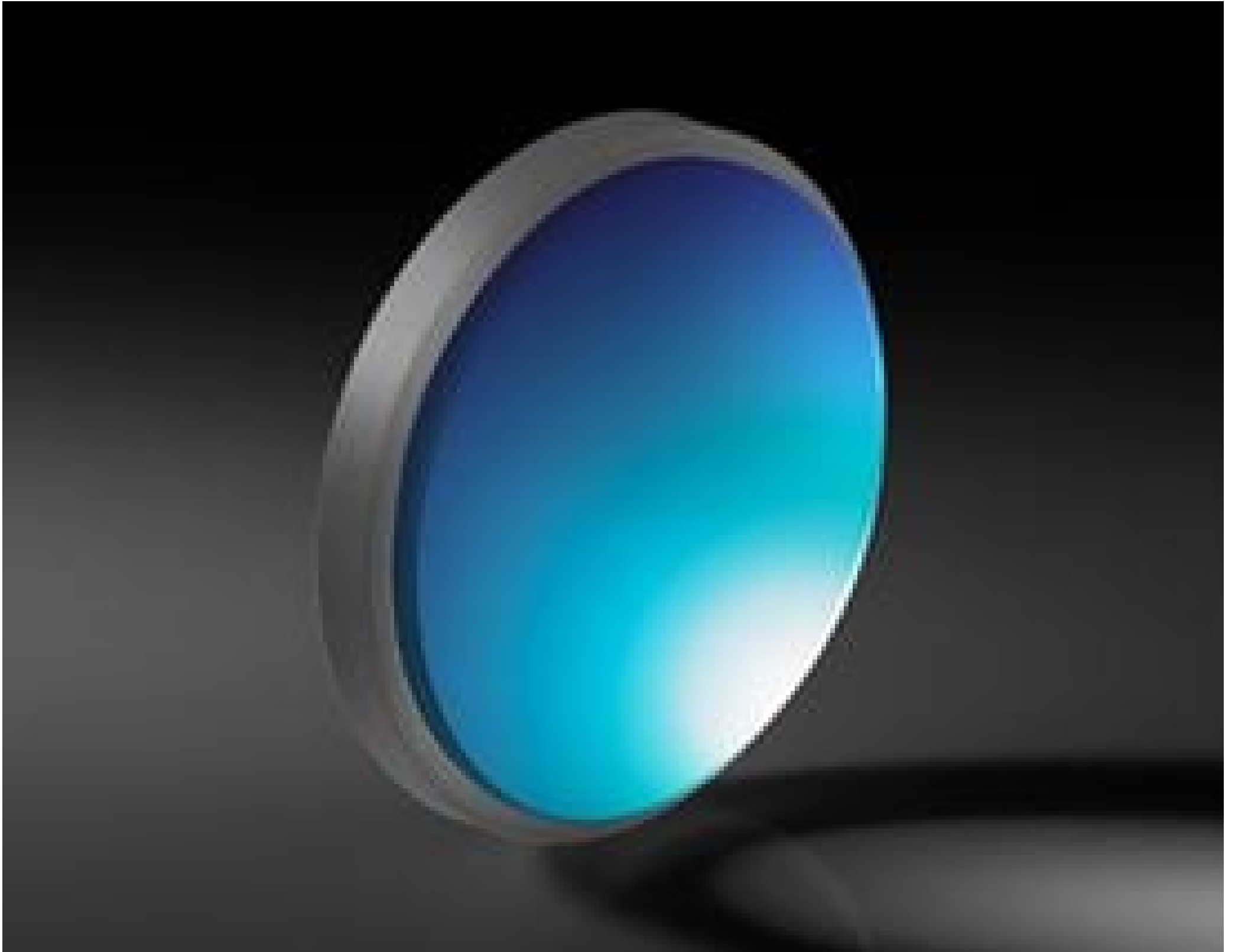
Unmounted Widefield 120i Tube Lens Lens