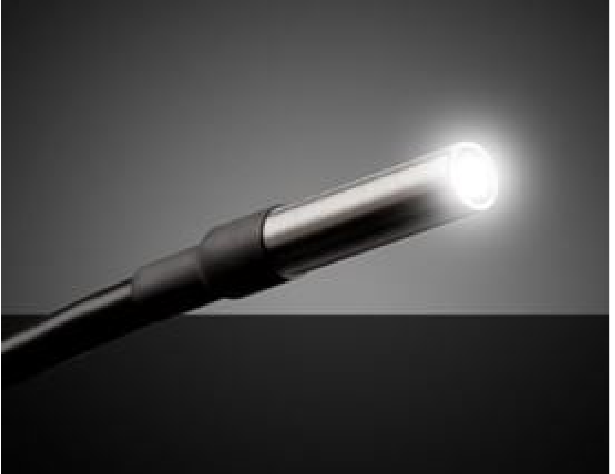
Advanced Illumination MicroBrite Spot Light