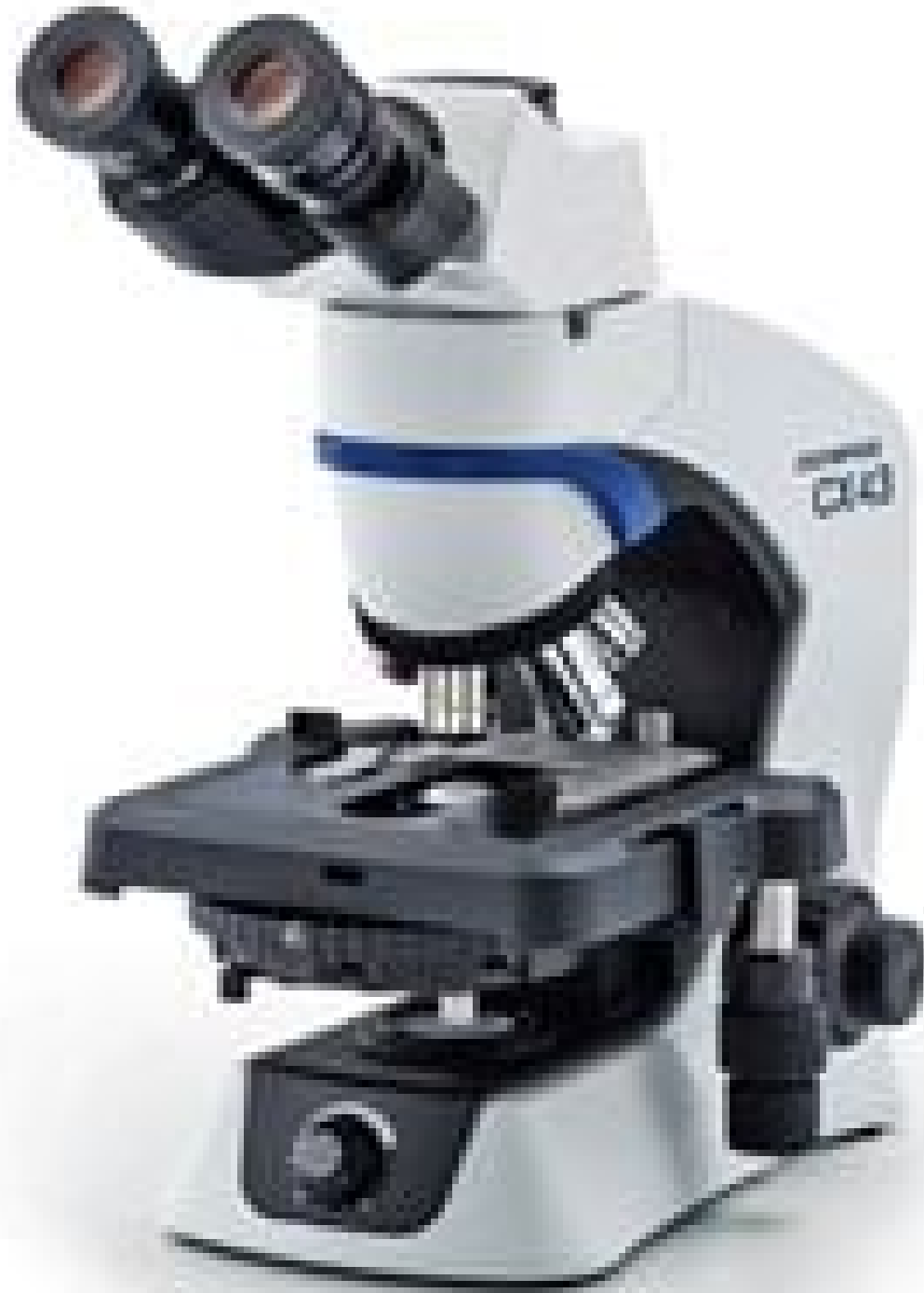
Image shown is full assembly. Each component sold separately. See Technical Information tab for additional details.