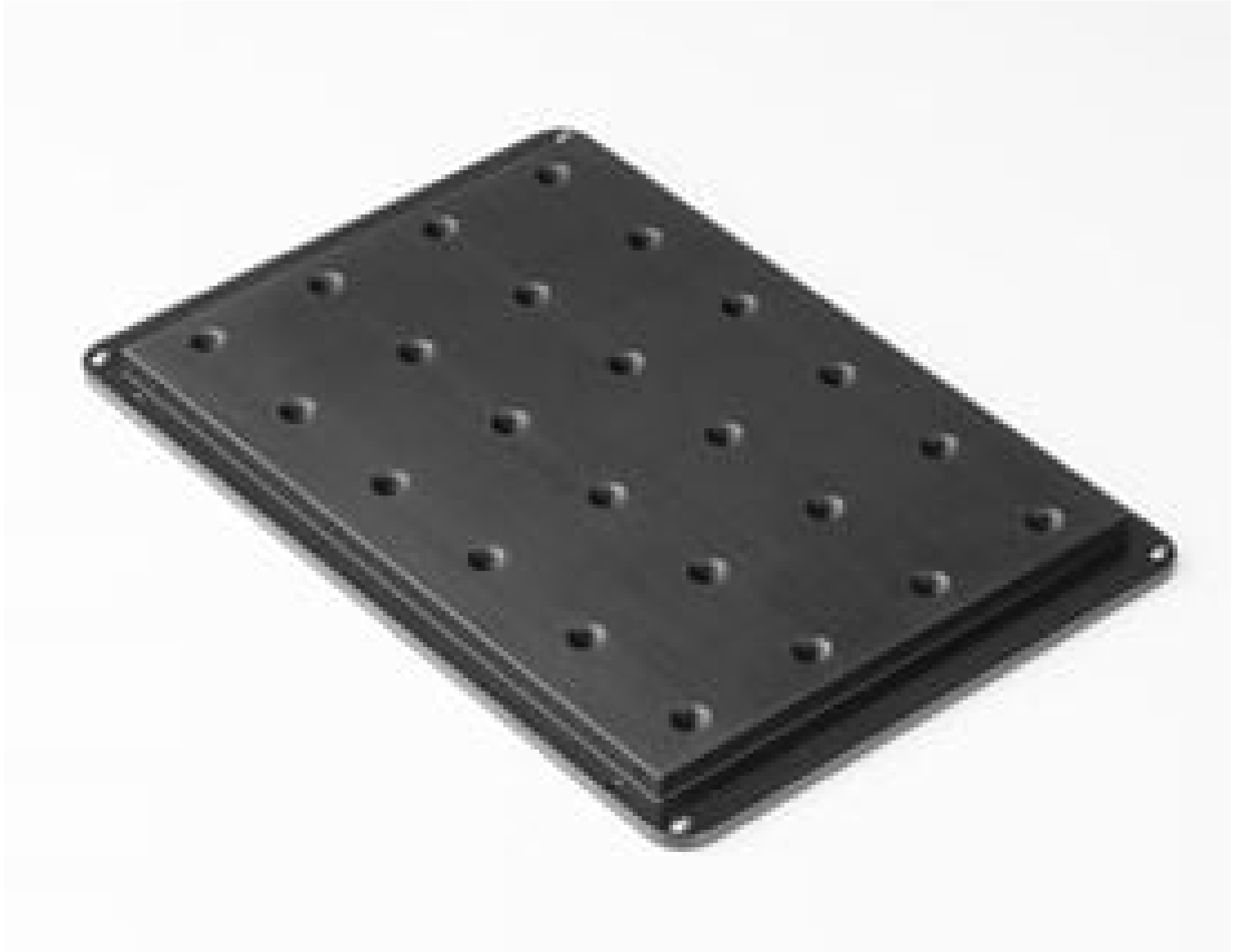
XY Microscope Stage Insert, Breadboard