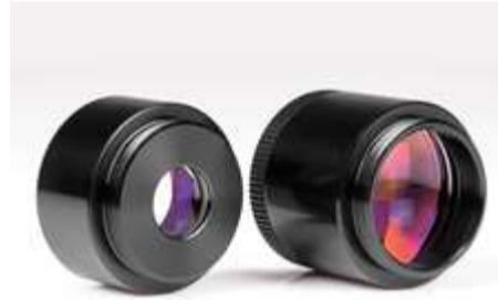
#56-353 - 25/25.4mm Diameter, C-Mount Thin Optic Mount C$138.60