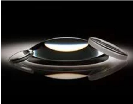
#33-363 - 25.0mm Dia. x 200.0mm FL, NIR II Coated, Plano-Convex Lens C$66.50